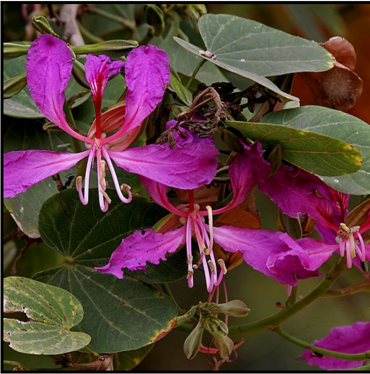
Phanera purpurea flower (kaniar) in Hyderabad, India, by J.M. Garg http://en.wikipedia.org/wiki/Phanera_purpurea Used under Creative Commons 3.0 license

Description: Evergreen tree to 10 m tall. Leaves thick and deeply-divided into two lobes. Showy flowers of variable color (pink, purple, red, cream), 8-10 cm wide. Fruits are a green legume turning dark brown at maturity.