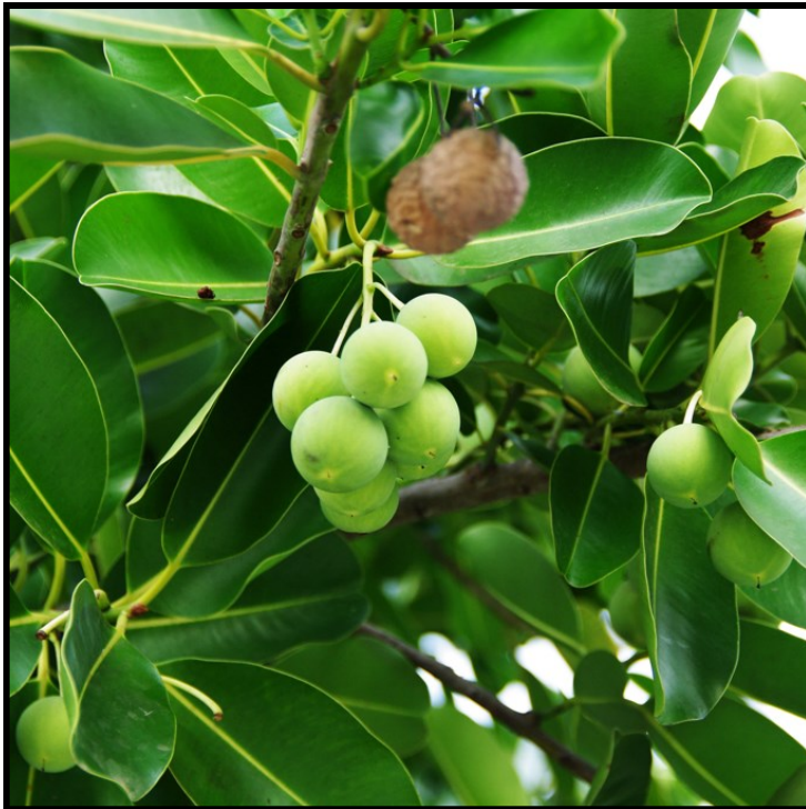
Calophyllum antillanum Britton photographed in San Juan, Puerto Rico, by Michael Reck http://commons.wikimedia.org/wiki/File:Calophyllum_antillanum_(Palo_Mar%C3%ADa)_picture_1.png Used under Creative Commons 3.0 license

Description: Medium sized tree with glossy, leathery leaves to 12 m tall. Leaves opposite, simple, stalked, elliptic, 10-15 cm long with entire margins. Small fragrant white flowers in clusters at leaf axils. Flowers have many yellow stamens. Fruit a round, hard-shelled, brown drupe.