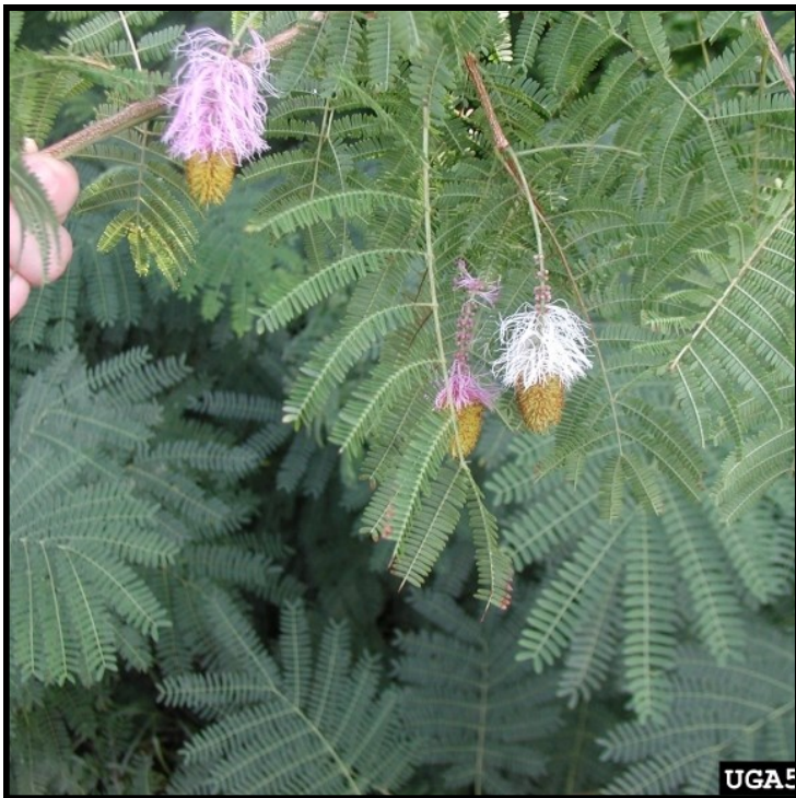
Tony Pernas, USDI National Park Service, Bugwood.org

Description: Semi-deciduous tree to 7 m tall. Bark brown except on new branches where it is green and hairy. Alternate spines up to 8 cm long, recurved. Leaves bipinnate, dark green above, pale below, leaflets and stalks hairy. Flowers in a pink hanging spike of dense flowers (bottlebrush-like). Fruit a narrow pod, yellow to brown, twisted, 10 cm long with 4 black seeds.