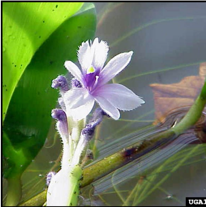
Kurt Stueber, Max-Planck-Institute for Plant Breeding Research, Cologne, Bug-

Description: Rooted perennial aquatic. Leaves alternate, submersed leaves sessile, emerged leaves stalked, the stalk not inflated. Showy purple flowers above water surface on erect stems, 7-50 flowers per stalk. Flowers summer through fall.