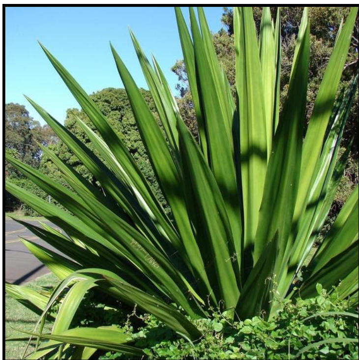
Forest and Kim Starr, Starr Environmental, Bugwood.org

Description: Robust shrub with basal rosette of stiff leaves to 3.5 m in diameter with a woody flowering stalk to 10 m in height. Leaves linear-lanceolate, fleshy, with marginal spines. Flowers on terminal panicles, white, fragrant, 2.5-3.3 cm long.