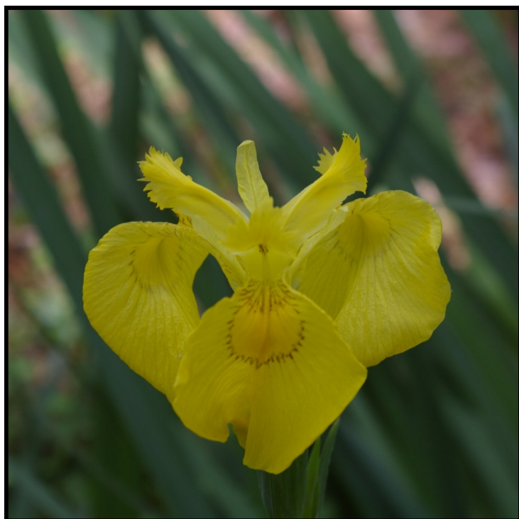
Nancy Loewenstein, Auburn University, Bugwood.org

Description: Perennial herb arising from a thick rhizome with black sap. Long, sword-shaped leaves are 10-30 cm wide and up to 1 m in length. The flowering stalk produces several yellow flowers, each subtended by a large, solitary bract. Flowers are 8-10 cm in diameter and typical of other irises - with three sepals and three petals situated on top of the inferior ovary and three stamens hidden beneath the three petal-like style branches. The petals often have purple veins and an orange spot at the base. Capsules are three-chambered and 4-8 cm long.