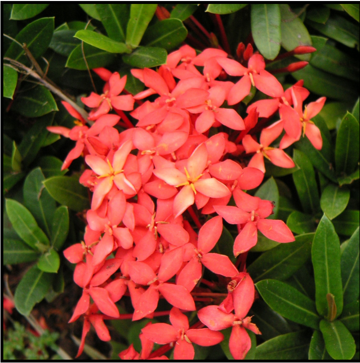
Ixora coccinea , Rubiaceae, by Louise Wolff http://commons.wikimedia.org/wiki/Ixora_coccinea Used under Creative Commons 3.0 license

Description: A dense, multi-branched evergreen shrub, commonly 1.2-2 m in height, but capable of reaching up to 3.6 m high. Ixora has a rounded form, with a spread that may exceed its height. The glossy, leathery, oblong leaves are about 10 cm long, with entire margins, and are opposite or whorled on the stems. Small tubular, scarlet flowers in dense rounded clusters 5-13 cm across are produced almost all year long. There are numerous named cultivars differing in flower color (yellow, pink, orange) and plant size. Several popular cultivars are dwarfs, usually staying under 3 ft in height.