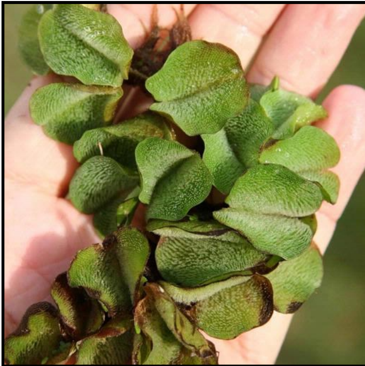
Robert Vid&#233;ki, Doronicum Kft., Bugwood.org

Description: Floating fern, mat forming, with rootless stems to 10 cm long. Leaves born in 3s, appear distichous (third leaf resembling roots), rounded to broadly elliptic, to 1.5 to 3 cm long and wide, often folded along the midrib, base cordate, hairy on both surfaces, papilla on upper surface with 4 distal hairs joined at the tips (resembling a basket).