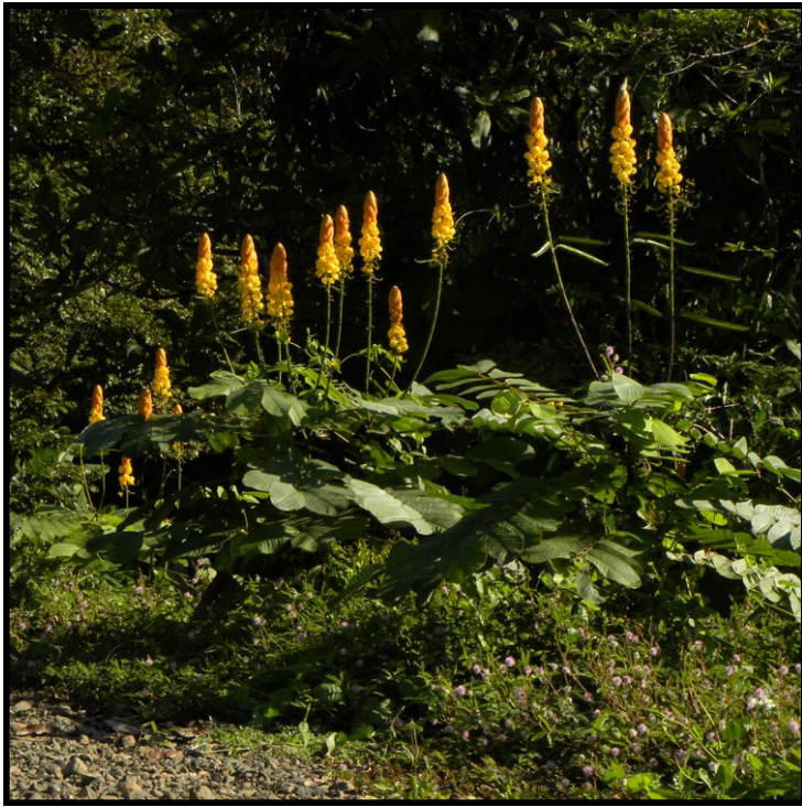
Senna alata (L.) Roxb.

Description: Evergreen shrub 3-5 m tall and 3 m wide. Leaves pinnate, up to 75 cm long. Leaflets in 7-14 pairs, oblong to obovate, 8-20 cm long and 3-10 cm wide. Inflorescence an erect axillary raceme 15-60 cm tall, arising from leaf axil, resembling a candle with bottom flowers opening first. Flowers bright yellow, 2.5 cm across, cup-shaped, petals 5. Sepals waxy and smooth to the touch. Fruit straight or slightly curved, 4-winged pod 10-20 cm long and 1.5 cm wide, dark brown to black when mature. Seeds 50 to 60 per fruit, flattened, triangular, to 6 mm long.