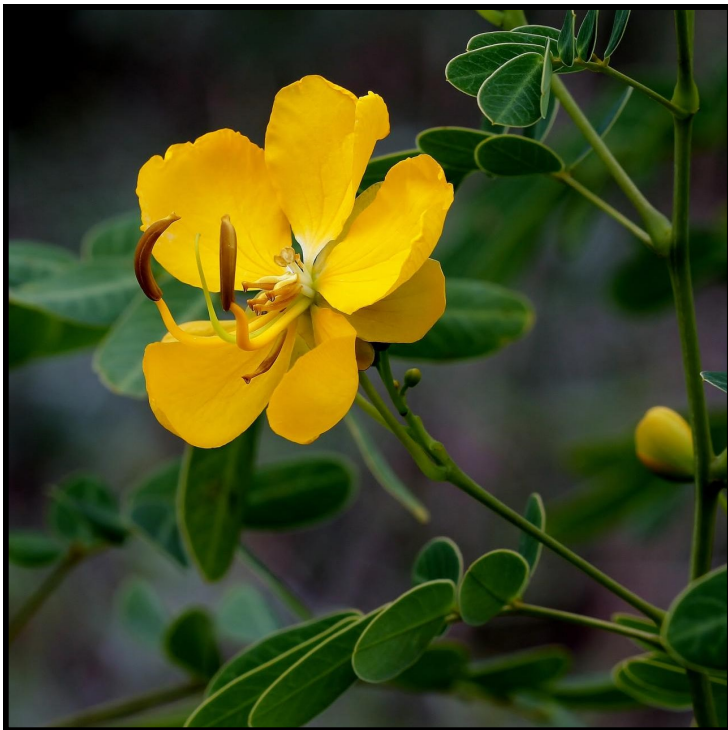
Senna pendula var. ambigua

Description: Sprawling evergreen shrub to 4 m tall and wide, with somewhat zigzag, sparsely hairy stems. Leaves alternate, stalked, even-pinnately compound. Leaflets in 3–6 pairs, oblong with rounded tips, terminal largest, to 4 cm long. Petioles with gland above, between lowermost leaflets and occasionally between others. Flowers yellow, 3–4 cm across, in 3- to 12-flowered showy racemes near stem tips. Stamen filaments prominent, curved. Fruit a brown slender, cylindrical, glabrous pod 7–12 cm long.